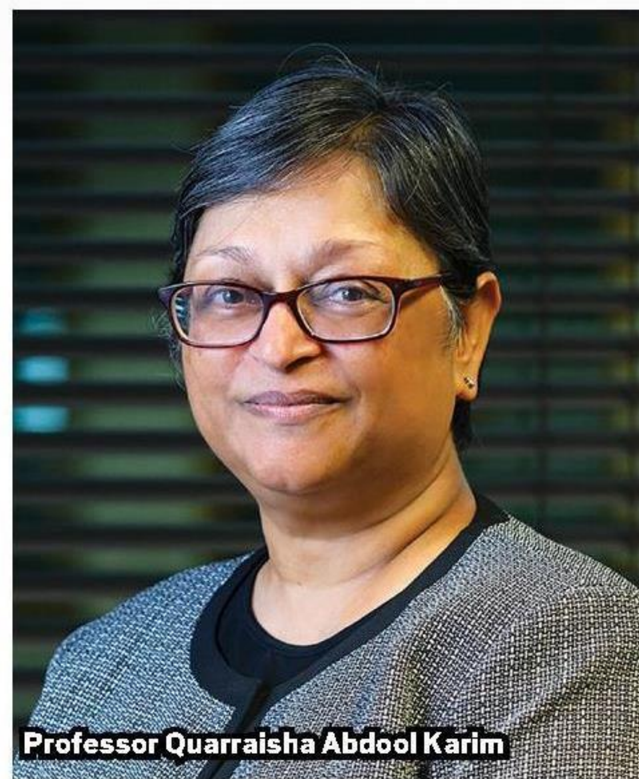
Professor Quarraisha Abdool Karim

recognised "for their discovery that antiretrovirals prevent sexual transmission of HIV, which laid the foundations for pre-exposure prophylaxis (PrEP), the HIV prevention strategy that is contributing to the reduction of HIV infection in Africa and around the world," the Gairdner Foundation said.